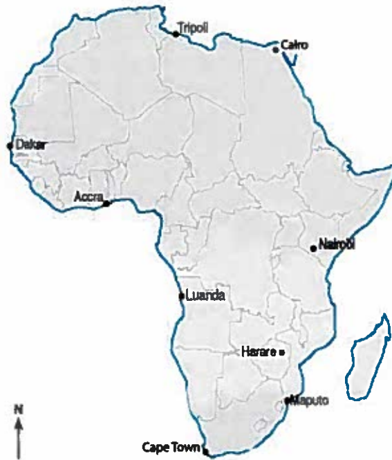
Figure 9a Africa

Figure 5b A satellite image that is a map. This map shows sea-surface temperatures on 5 September 2011. Maps like this are used by fishermen, weather forecasters and even by board-surfers. Comparing maps year by year gives evidence of climate change and clues to when more rain can be expected in southern Africa.