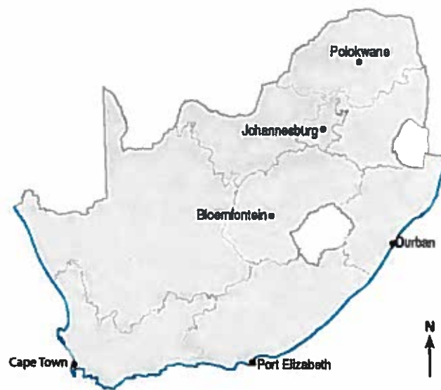
Figure 9a South Africa