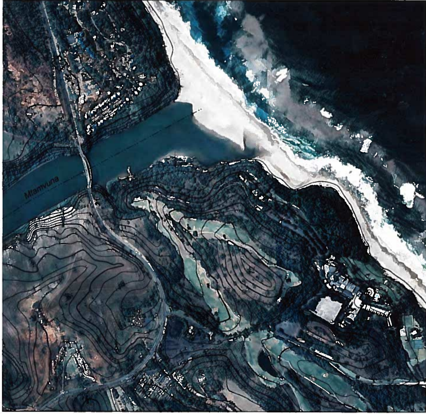
Figure 22 An orthophoto map showing part of the area around Mzamba on the southern border between KwaZulu-Natal and the Eastern Cape