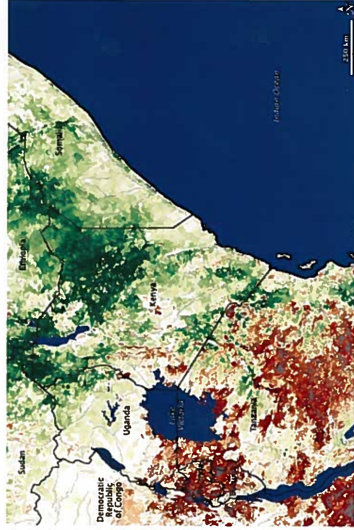
Figure 1 This satellite map of East Africa helped prevent many deaths.