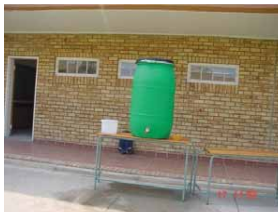
1.3.3. Sanitation facilities on site