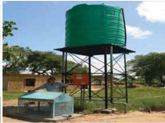
1.3.2.3. Rain harvesting on site