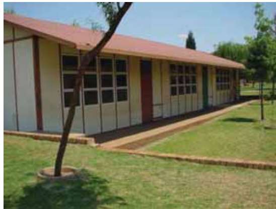
1.3.6.8. Wood used as building material for walls on site