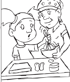
u bika na nhe