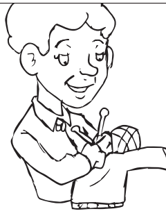
u nyitela zwithu