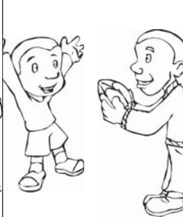
u tamba na nhe